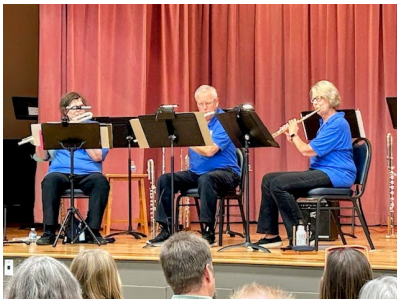
Festivo Ensemble performing beautiful music at IEVFS Annual membership recital